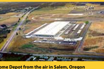
Home Depot from the air in Salem, Oregon