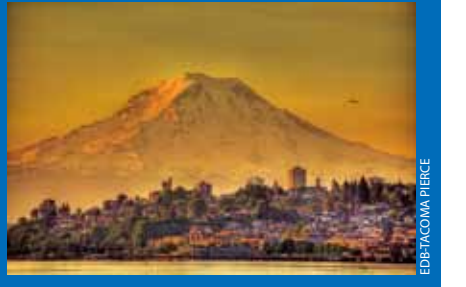
Mount Rainier in Pierce County

Japanese logistics powerhouse Mitsui-Soko is one of the newest additions to the region's aerospace industry. Toray Composites, the innovative leader in industrial composites, recently completed a multimillion-dollar expansion of their production facility. The county is also home to developers, as well as manufacturing and industrial companies.