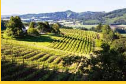
David Hill Vineyard in Tualatin Valley

Oregon's premier shopping destinations, Washington Square and Bridgeport Village. Adventure-seekers can feel the thrill of flight along a zip line or in an indoor skydiving tunnel. Photograph the scenic beauty of the forest along the Banks-Vernonia State Trail, while soaking in the peaceful sights and sounds of nature.