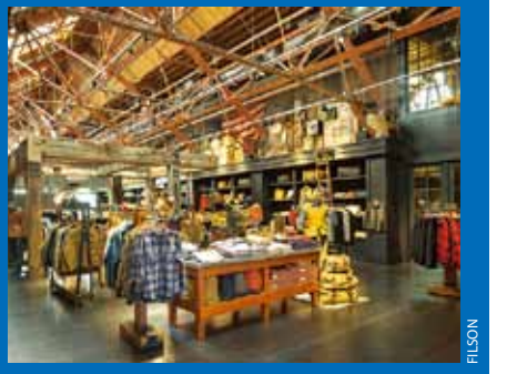
Filson's flagship store in Seattle

Filson, while narrowly distributed in Japan, remains a highly treasured and exclusive brand there. Now, with its local partners, Filson has just opened