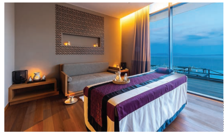
Eliminate your worries and stress at Angsana Corfu