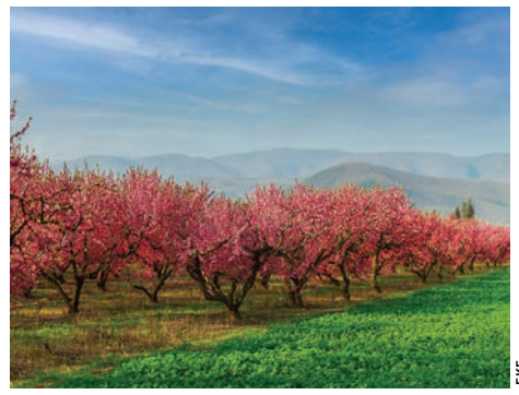
A peach orchard of Venus Growers